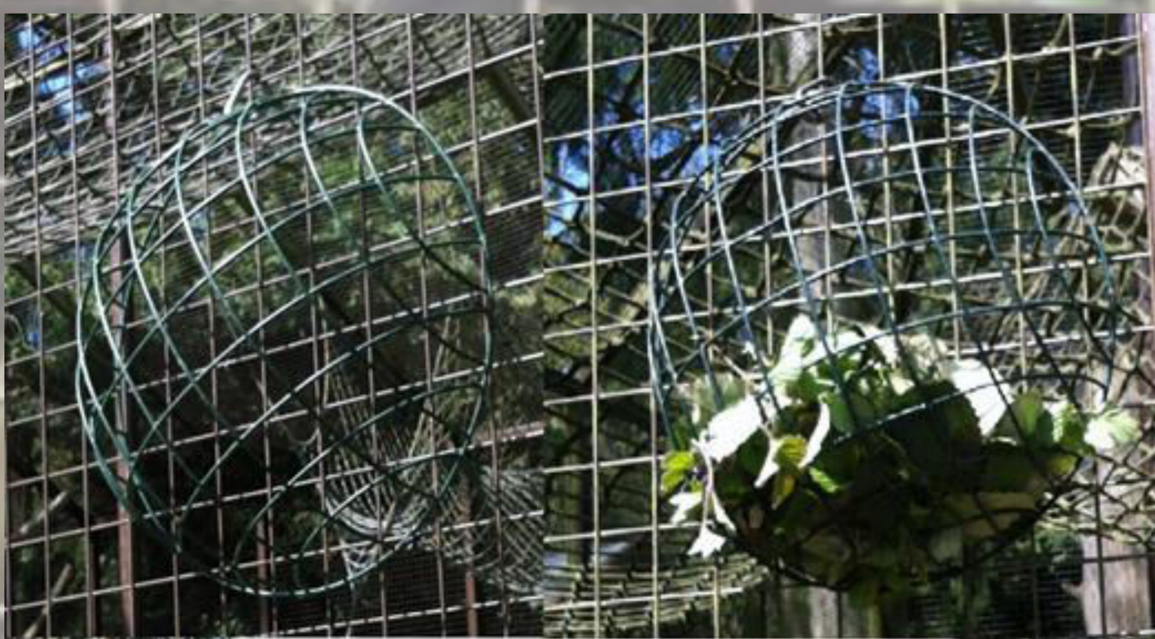
Figure 1: Browse presentation