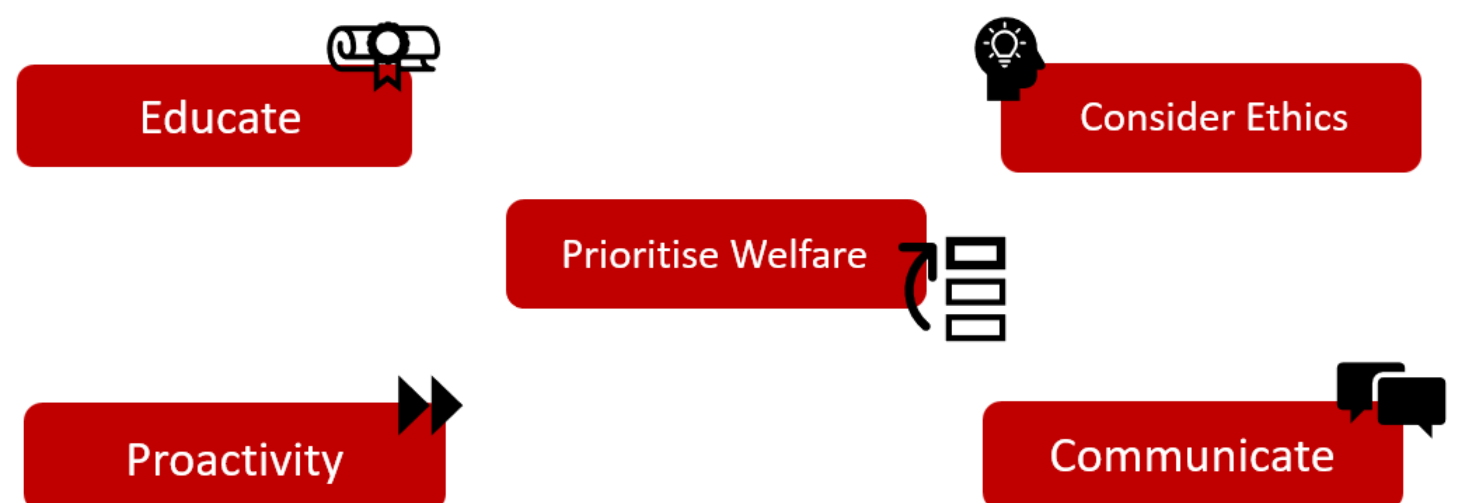
Figure 2 Recommendations for the equine industry moving forward (adapted from Douglas, Owers and Campbell, 2022)