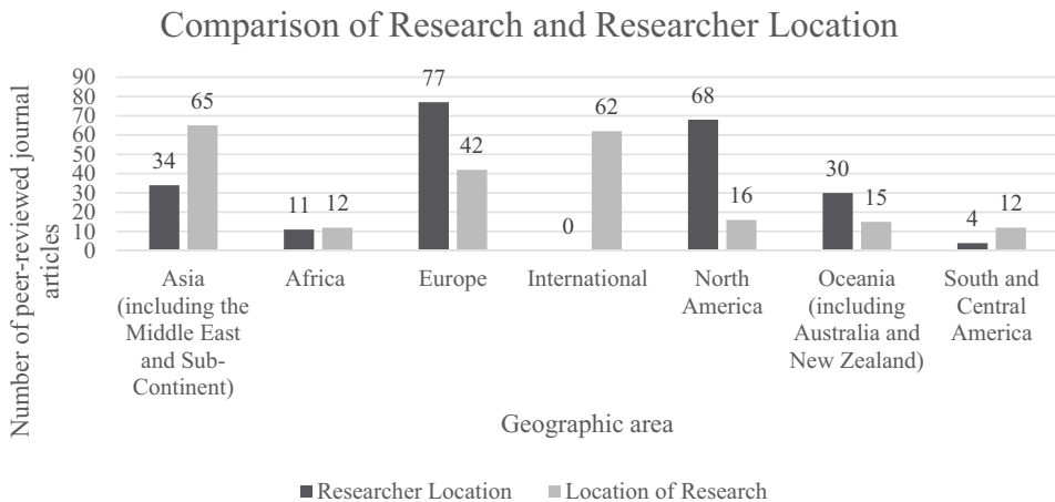
Figure 2. Comparison of research and researcher location.

focus shows peaks in pieces about South-East Asia, including China, South Korea and Japan, and Qatar in the Middle East. These countries and contexts for research relate to significant political contexts for hosting sport mega-events in non-Global North nations, such as Japan's multiple Winter and Summer Olympic and Paralympic bids and Games, the 2022 FIFA Men's World Cup in Qatar or the 2008 Summer Olympic and Paralympic Games in Beijing, China. Yet, of the 65 pieces focusing on Asia, only 34 researchers were based in the geographic region. The least represented areas of the world are Africa and South and Central America. Given the rich connection to sport mega-events, in particular, the recent FIFA Men's World Cup and Summer Olympic and Paralympic Games in Brazil, or the historical connections to sport, South Africa and the Apartheid, this imbalance is concerning, but unfortunately reflects wider low academic representation from these geographical regions.