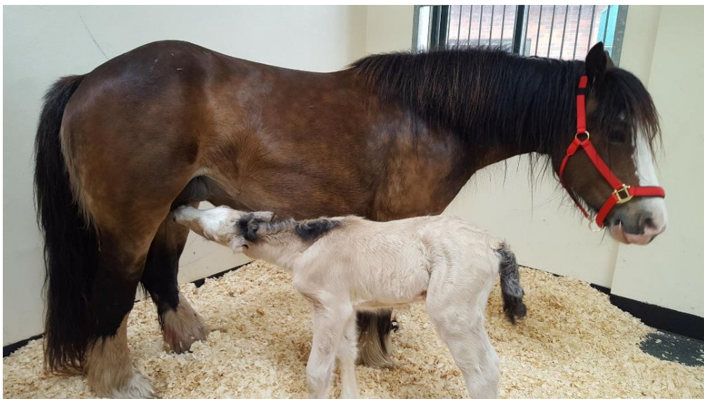
Plate 2: Foal nursing from mare in a hospital environment.