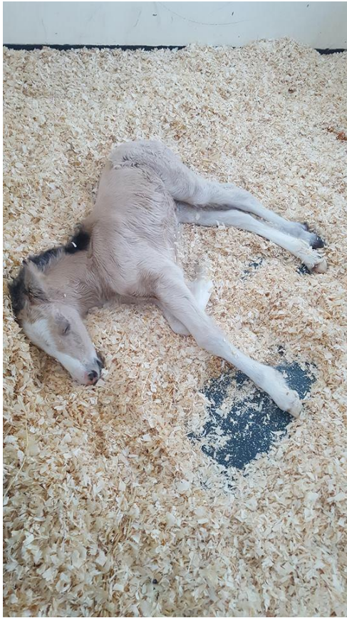
Plate 1: Relaxed foal following a well-managed separation from the mare.

issue. Such as, allowing the mare to sniff and touch the foal every time they enter the accommodation to carry out a nursing intervention.