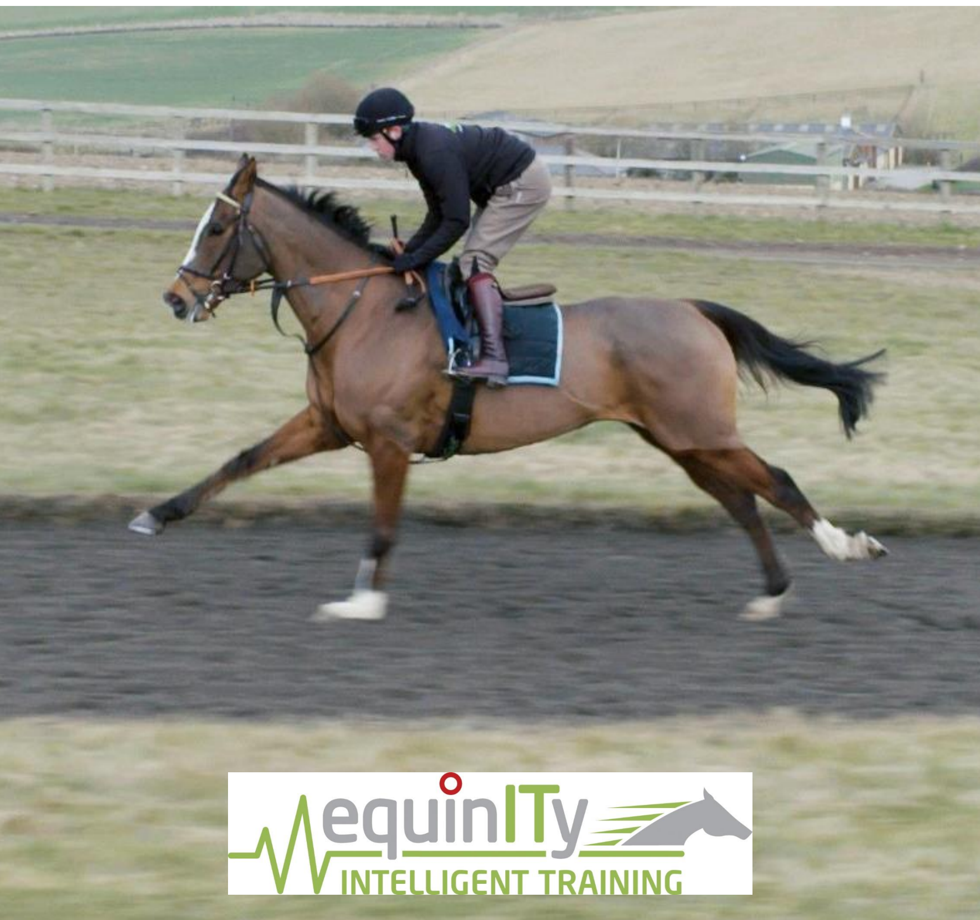
Fig. 1: Racehorse completing gallop exercise (4 furlong, all-weather gallop: sand & carpet fibre mix, 8cm depth) wearing equinTy™ system (equinTy, 2018)