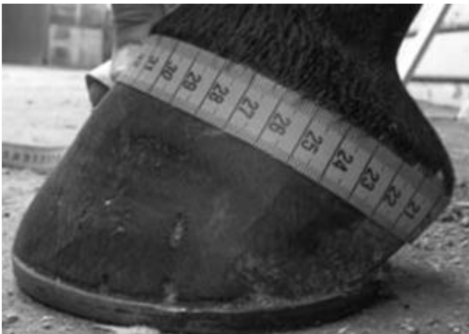
Figure 1: Tape measure positioning (Decurnex et al., 2009)

INTRODUCTION: The equine hoof is a resilient and pliable smart structure that over time has adapted to withstand the demands of evolution and domestication. The hoof is one of the main structures involved in the absorption of forces whilst the horse is working. If the hoof becomes compromised, further limb structures will be required to compensate, increasing their vulnerability and potentially resulting in lameness (O’Grady, 2003). The dynamic structure of the horse’s hoof is put under extensive strains through loading during locomotion (Pollitt, 2004) and adjusts to the loading forces through a change in its conformation (Kroekenstoel, et al. 2006). Changes to the circumference of the coronet band have been documented in racehorses between period of rest and training with the circumference decreasing as workload increased and reverting during a decrease in workload (Decurnex, Anderson and Davies 2009). The aim of this study was to determine whether a change in circumferential hoof parameters would be observed within a population of non-racing horses with an increase in workload.