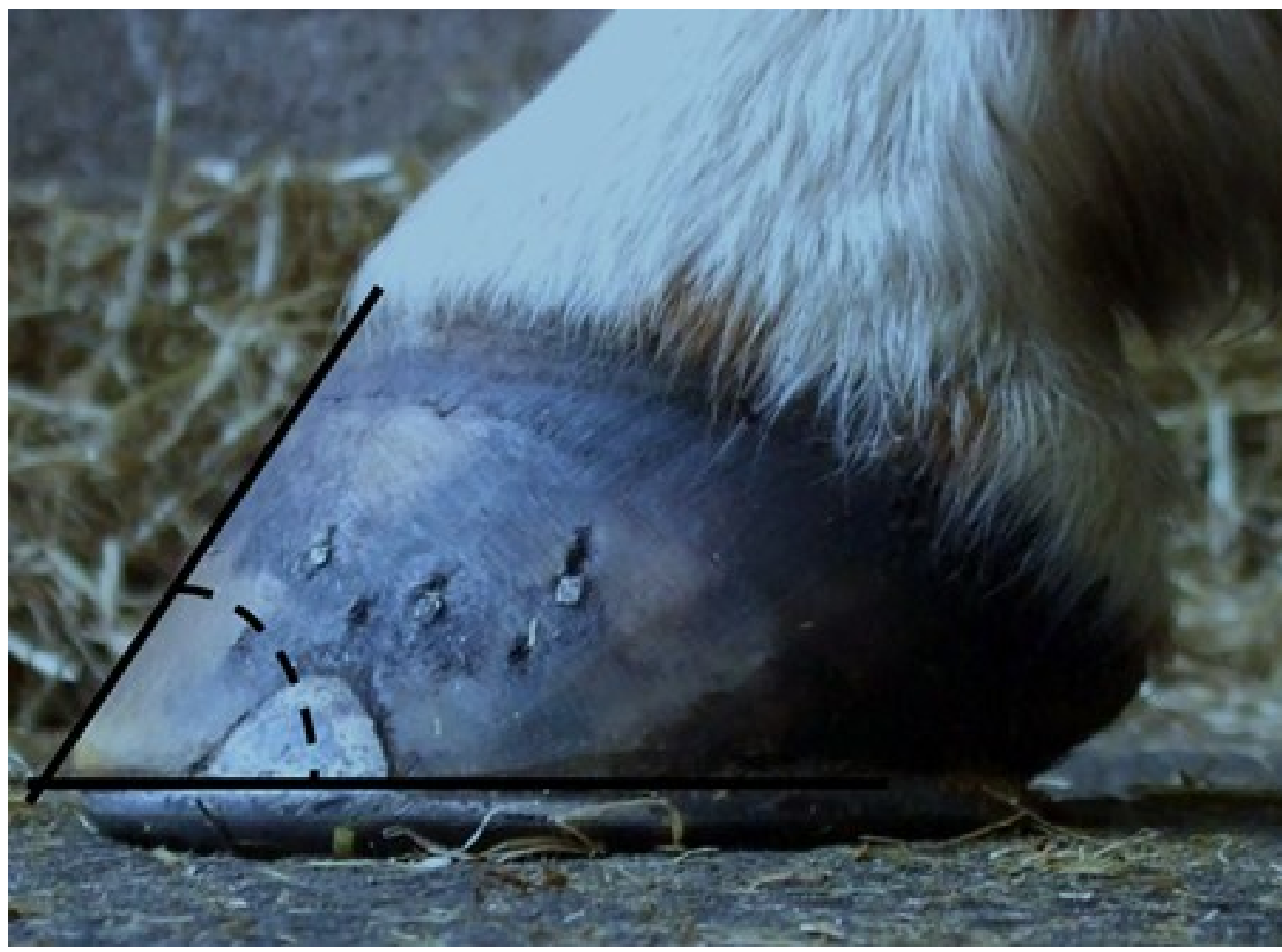
Figure 1: Lateral digital view of the hoof used to determine TA using Dartfish software

The complex equine hoof provides leverage, support and shock absorption for the limb. The ratio of body mass to weight bearing surface is very high in the horse yet the hoof is able to cope with the significant concussive stresses it is subjected to (Parks 2003; MacDonald 2006). Research has identified the shape of the hoof as a significant contributor to the onset of foot disease and prevalent injuries of the distal limb (Dyson et al, 2006; Gill 2007). As the balance and conformation of the hoof dictates the way in which the foot interacts with the ground, hoof shape directly influences the magnitude and direction of the forces entering the limb (Back 2001; Parks 2003). In addition, the forces entering the foot also influence the rate of growth within different regions thus creating a cyclic pattern and predisposing to injury. As disorders of the equine foot are among the most common causes of lameness, a clearer understanding of factors which influence hoof shape could enable better treatment for, or prevention of, some forms of foot-based lameness. The aim of this investigation was therefore to identify whether a relationship exists between body weight and height on hoof conformation.