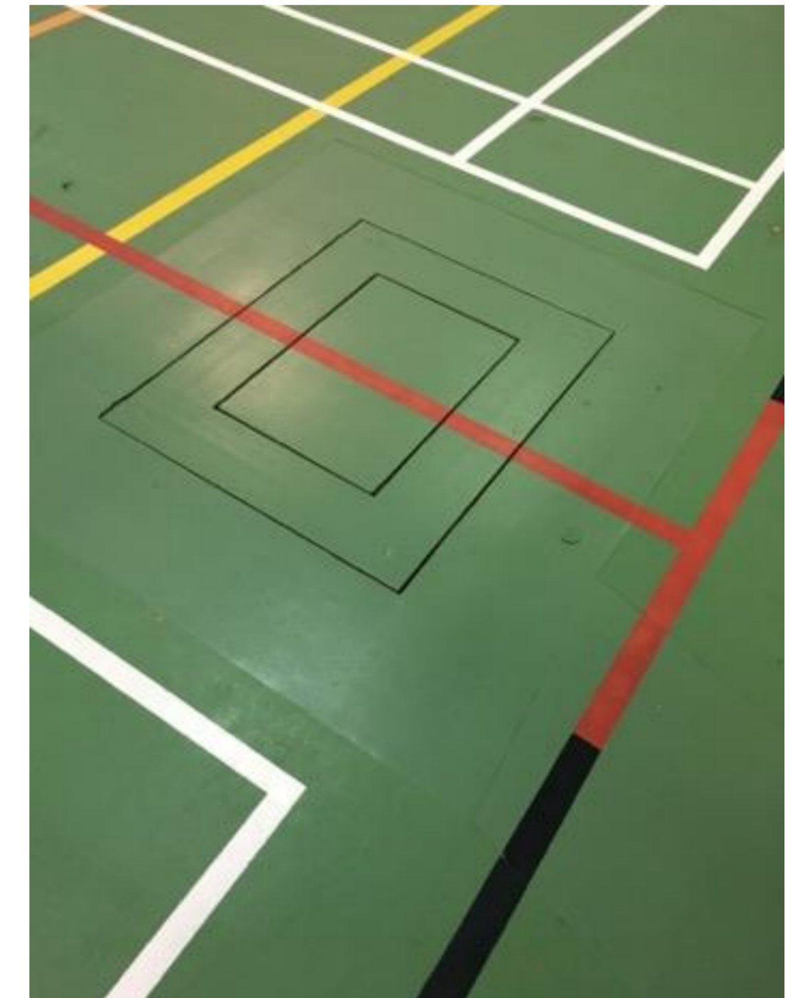
Figure 2. AMTI Force Plate

A sample population of n = 17 medium and large breed dogs of varying age (mean 5.30 \pm 4.16 years) and a range of BCS (mean 3.06 \pm 1.14 ) were recruited for this study (Figure 1). The dogs were free from any predisposing musculoskeletal conditions. Dogs were body condition scored using PFMA guidelines and the study population were assigned weight categories dependent on the recommended weight range for their breed. Dogs were lead on a loose lead over an AMTI force plate (sampling at 500Hz; Figure 2) to record GRFs in the mediolateral, craniocaudal and vertical plane ( F_x , F_y and F_z ). Individually, dogs were walked over the force plate up to fifteen times to attempt to achieve twelve valid trials. Peak F_x , F_y and F_z GRFs (N) were calculated for all trials for all dogs. A Spearman's rank test was used to test for a correlation between BCS and average peak GRFs and a Kruskal-Wallis was used to assess for differences in GRFs between BW categories. Where significant differences were identified, post-hoc tests were carried out with the Bonferroni correction applied.