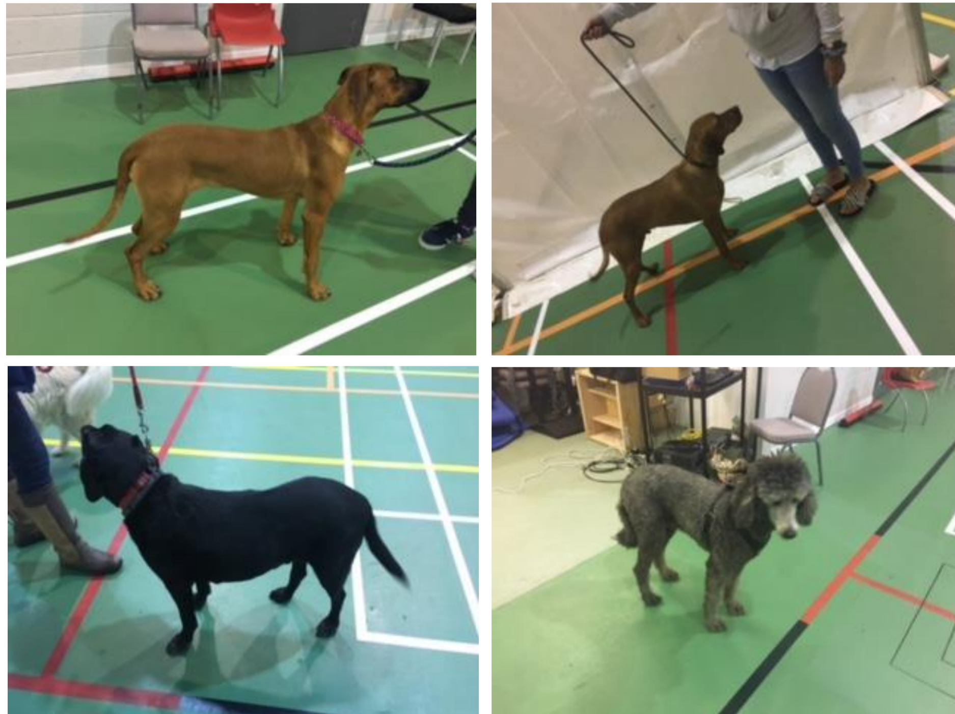
Figure 1. Sample Population

An example of the breeds used in the study sample (From top left a Rhodesian Ridgeback, Hungarian Visla, Black Lab x Pointer and a Standard Poodle)